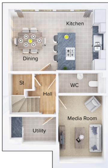
Lower ground floor