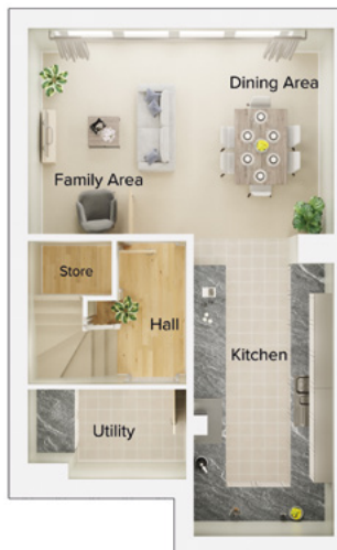
Lower ground floor